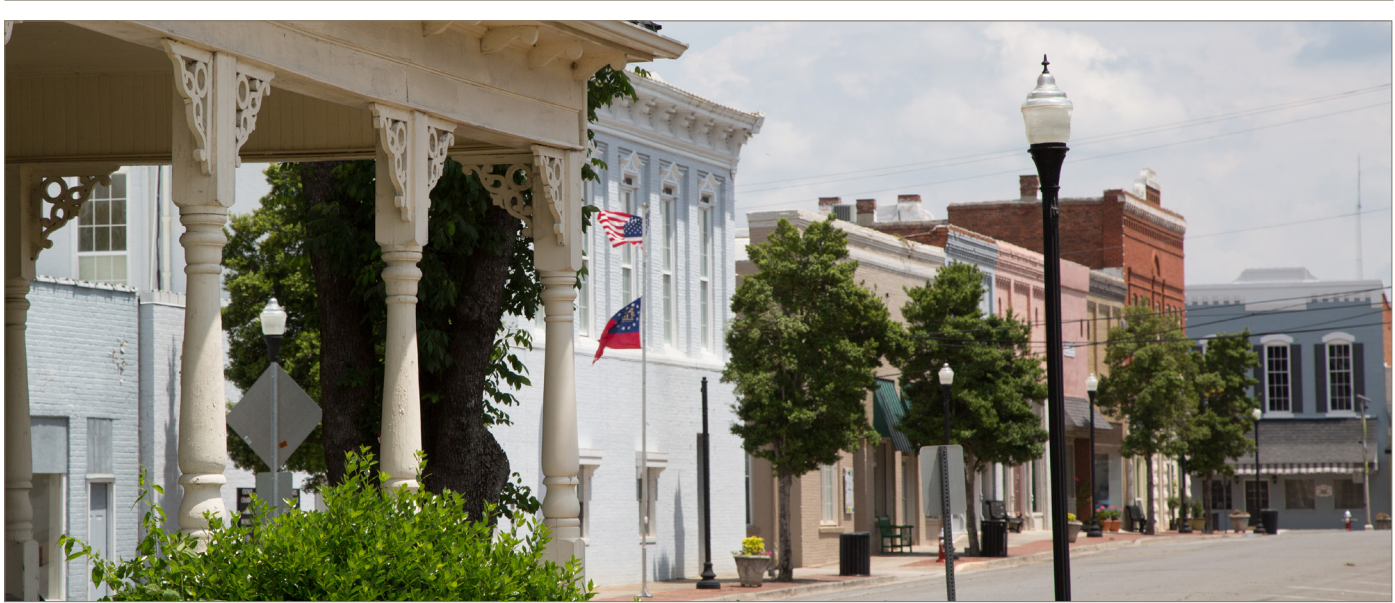
Downtown Sandersville, Ga