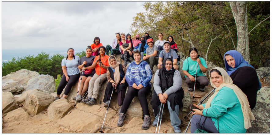
Summiting Pine Mountain in Bartow County

Inaugural year for Refugee Women's Network hikers is a success!