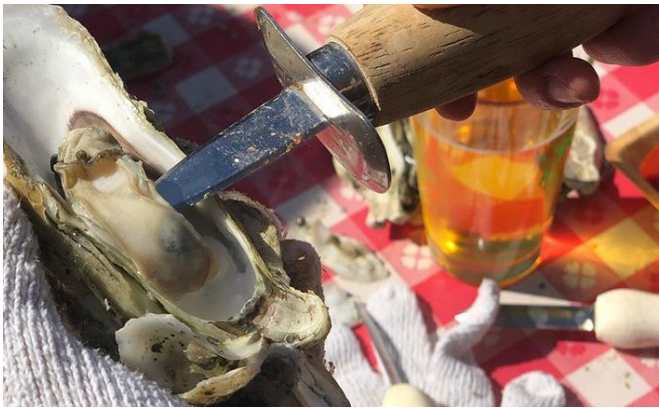
Shucking away at the Oyster Roast

Learn more at www.gaconservancy.org/oysterroast