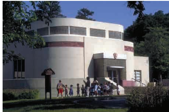
Ocmulgee National Monument

Little is known about central Georgia in the sixteenth and seventeenth centuries until the British established a trading post on the Ocmulgee River between 1685 and 1690. During that period, several Creek towns that had been located along the Chattahoochee River moved