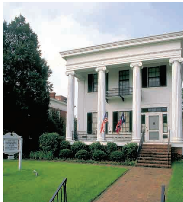
The Cannonball House

Macon's first railroad was built in 1838. By the time of the Civil War, Georgia led the South in railroad development, and Macon was the railroad hub of Georgia. Its central location made Macon a prime manufacturing, storage, and distribution point. Although Atlanta subsequently became the railroad hub of the state, Macon remained a critical railroad nexus, providing access to the vast cotton economy of Georgia. Today, two interstate highways, I-16 and I-75, meet at Macon, and the Macon-to-Atlanta commuter rail line is planned to be one of the first developed.