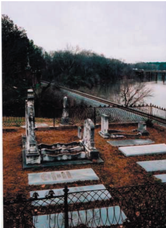
Rose Hill Cemetery

Central City Park, laid out along the banks of the Ocmulgee River soon after the founding of Macon in 1823, was established in 1826 as a public park.