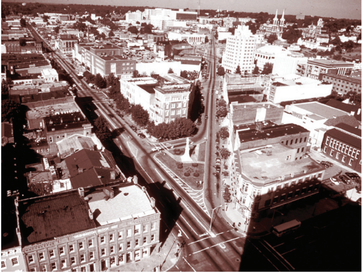
Historic Downtown Macon

began settling the land surrounding the fort. During the War of 1812, Fort Hawkins was an important site for the housing and distribution of troops. After 1819, however, the fort was no longer in use and the buildings gradually fell into disrepair.