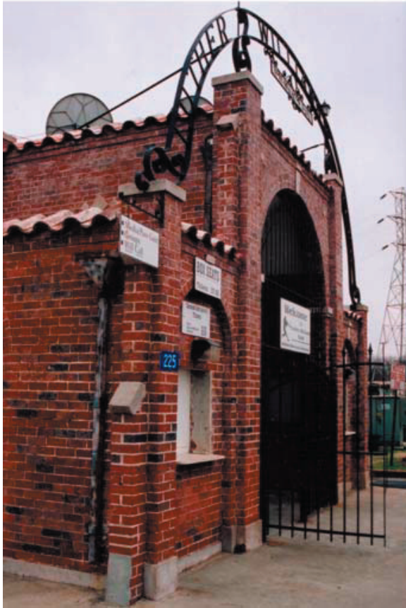
Central City Park

1897 to provide clean and affordable water to the city. It is an exemplary late-nineteenth century water works facility. Ownership of the plant changed in 1926. It was remodeled in 1936. In 1994, the plant was seriously damaged by the Ocmulgee River flood and its function was abandoned. Nevertheless, 250 acres of the water works property may be donated to the Macon-Bibb County Urban Development Authority for the Ocmulgee River Trail trailhead, and the area will serve as a public regional park and recreation area for boating, hiking, and camping.